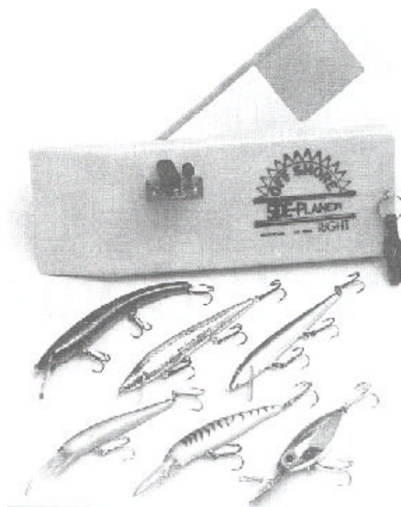
Clockwise from top: Off Shore Side-Planer; Rapala; Hot 'N Tot; Bomber 24A; Deep Jr. Thunderstick; Ripstick; Rattlin Rogue.

Setting out a small planer board presents a simple chore. With the boat moving ahead at trolling speed, let a lure out behind the boat as far as you deem necessary.